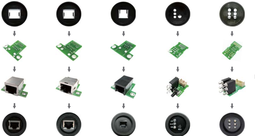
GTT-POERJ45PCB-AG GTT-POERJ45LEDPCB-AG GTT-POERJ11PCB-AG GTT-11100R-LED-AGM GTT-111111-LED-AGM