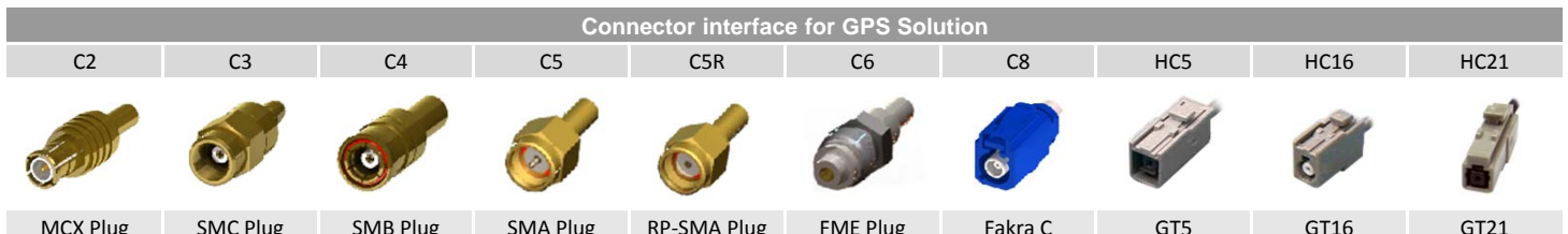
Connector interface for GPS Solution

CX or HCX* : Interface Connector for GPS *Using Hirose original GT series connectors See below chart for varied solutions