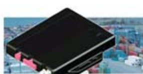
Tracking & Tracing