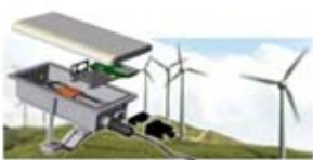
Remote Maintenance & Control